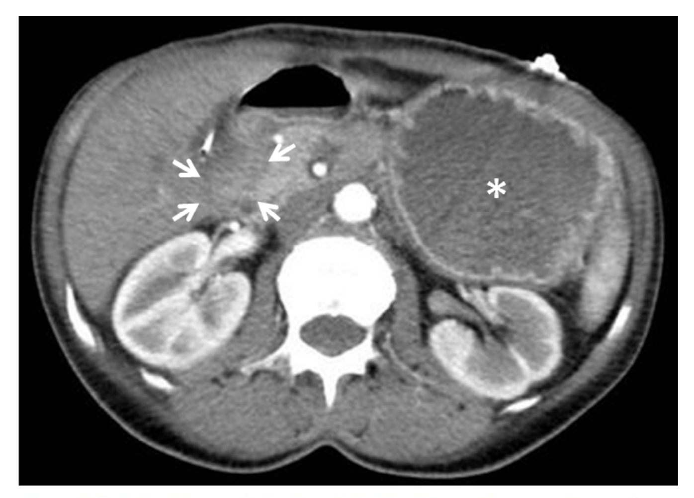
Figure. 1. Axial arterial phase contrast enhanced CT of the abdomen. This image is demonstrating an ill-defined mass-like hypo-attenuation in the region of the pancreatic head (arrows) with gastric distention (asterisk) secondary to outlet obstruction.

Exploratory laparotomy on the fourth day after admission revealed a golf-ball sized duodenal mass that was adherent to the head of the pancreas. A pancreaticoduodenectomy with placement of gastrostomy and jejunostomy tubes was performed. Intraoperative needle biopsies sent for frozen section demonstrated fibrous connective tissue with atypical ductal cells and invasive moderately differentiated pancreatic ductal adenocarcinoma with perineural invasion. One nodal metastasis (1/14) was confirmed on the surgical specimen (Figure 2).