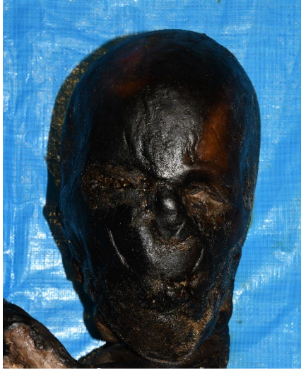
Figure 3. Mummified facial tissue.

Mummified tissue of the head and anterior right arm were noted. The facial tissue to the right side of the face appeared compressed suggesting contact with a hard surface for an extended