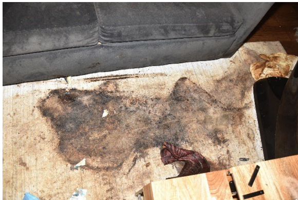
Figure 2. Decomposition stain in the living room.

was 78 degrees Fahrenheit according to the digital thermostat within the residence. Evidence of alcohol consumption and